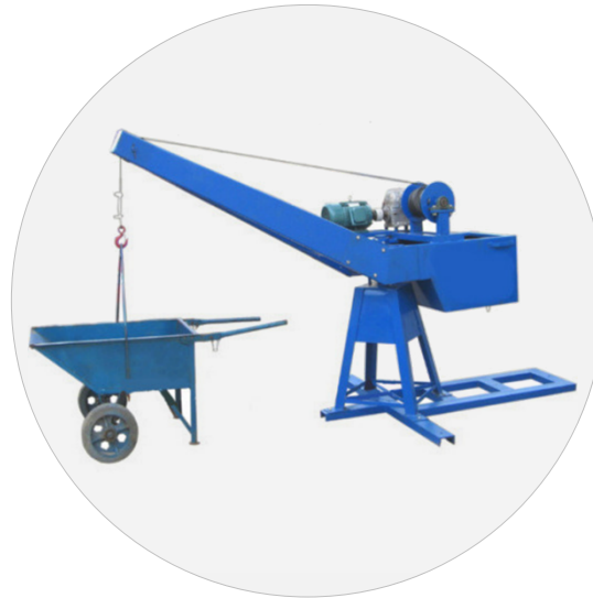
Monkey Lift sufficient for 8 Floor Building