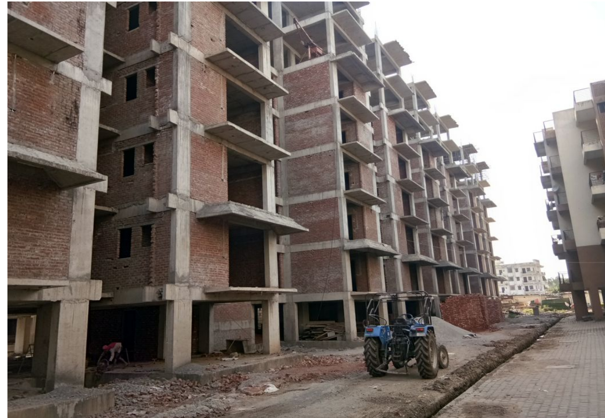
GTM FOREST LAVANA : HARIDWAR ROAD