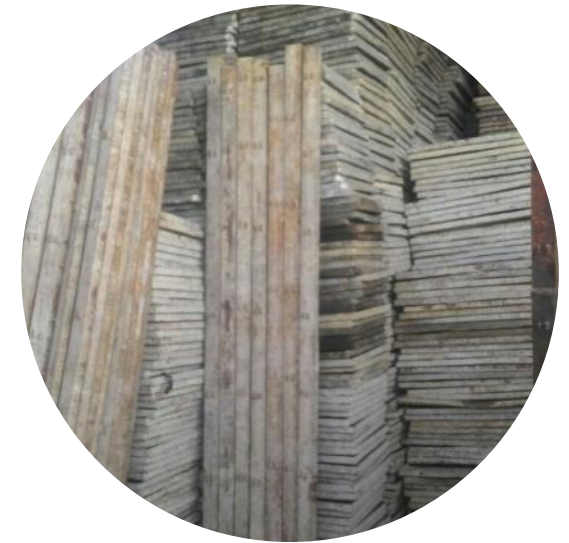
Roof Shuttering Material

This reduces our market dependency and helps us save time on construction leading to on time delivery of your projects.