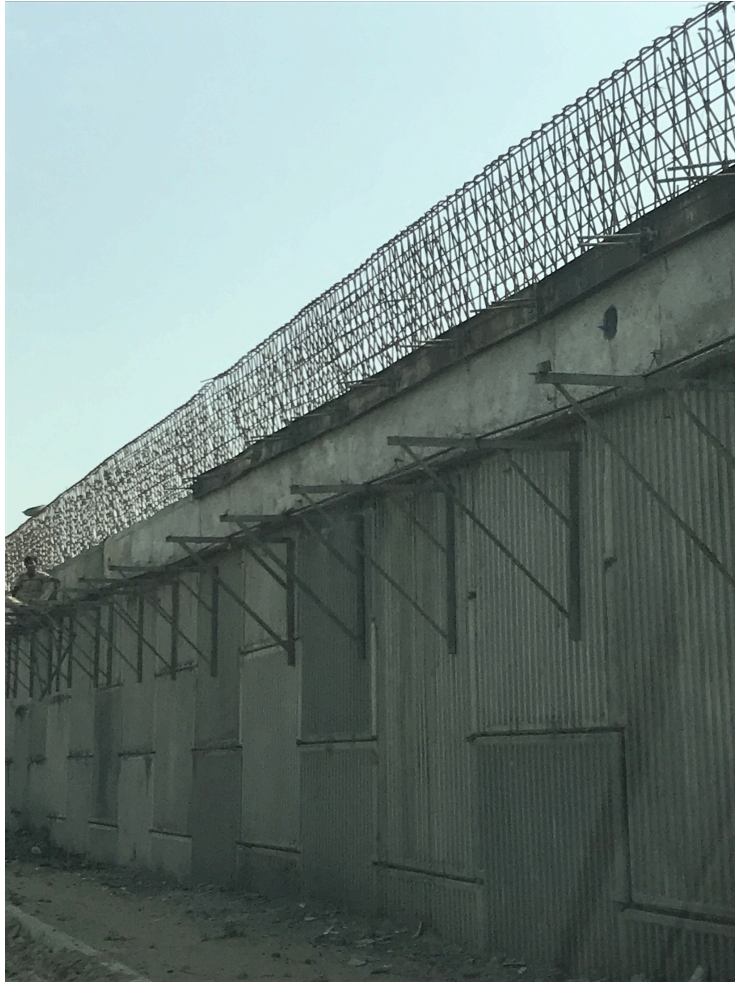
CRASH BARRIER WORK ON NH-74