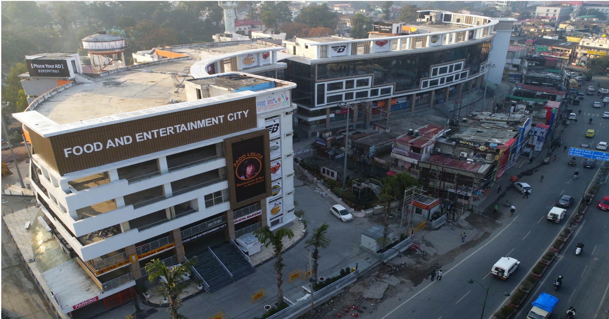
MDDA COMPLEX : FOOD & ENTERTAINMENT CITY -- CLOCK TOWER, DEHRADUN