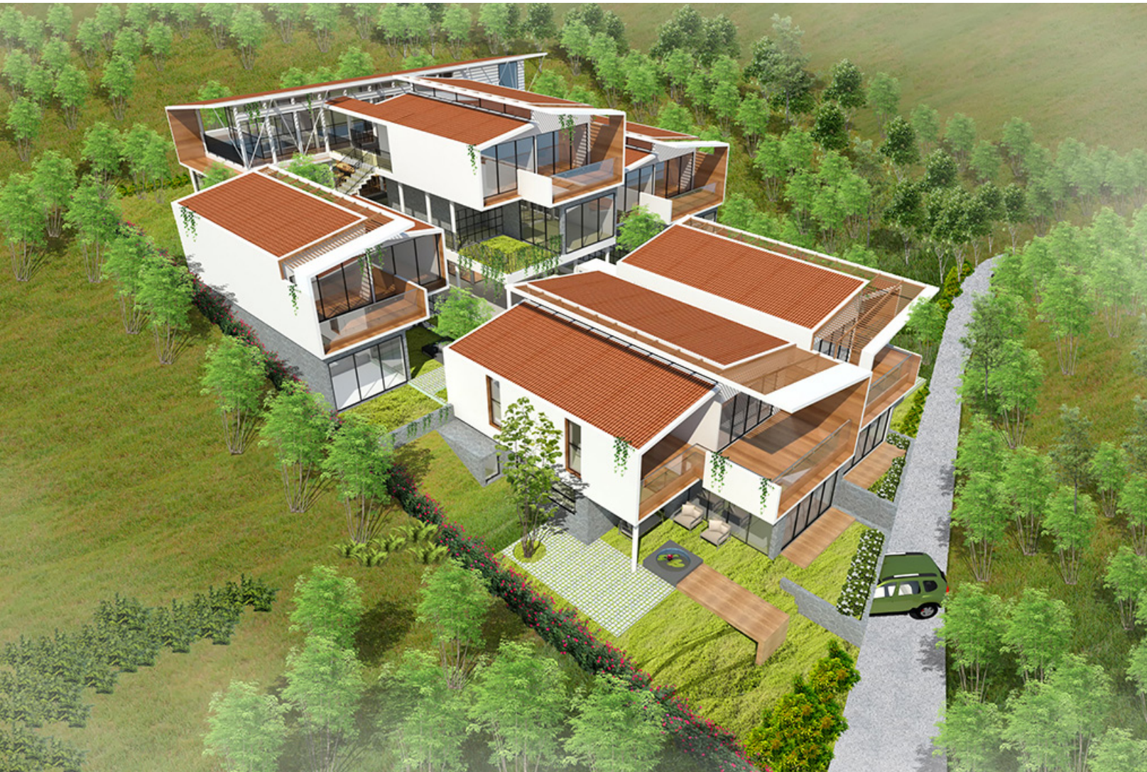
Birds eye view of The Himalayas