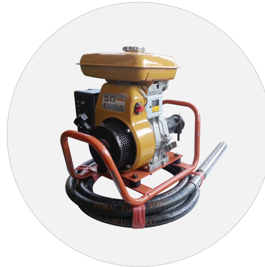
Concrete Vibrator Machine