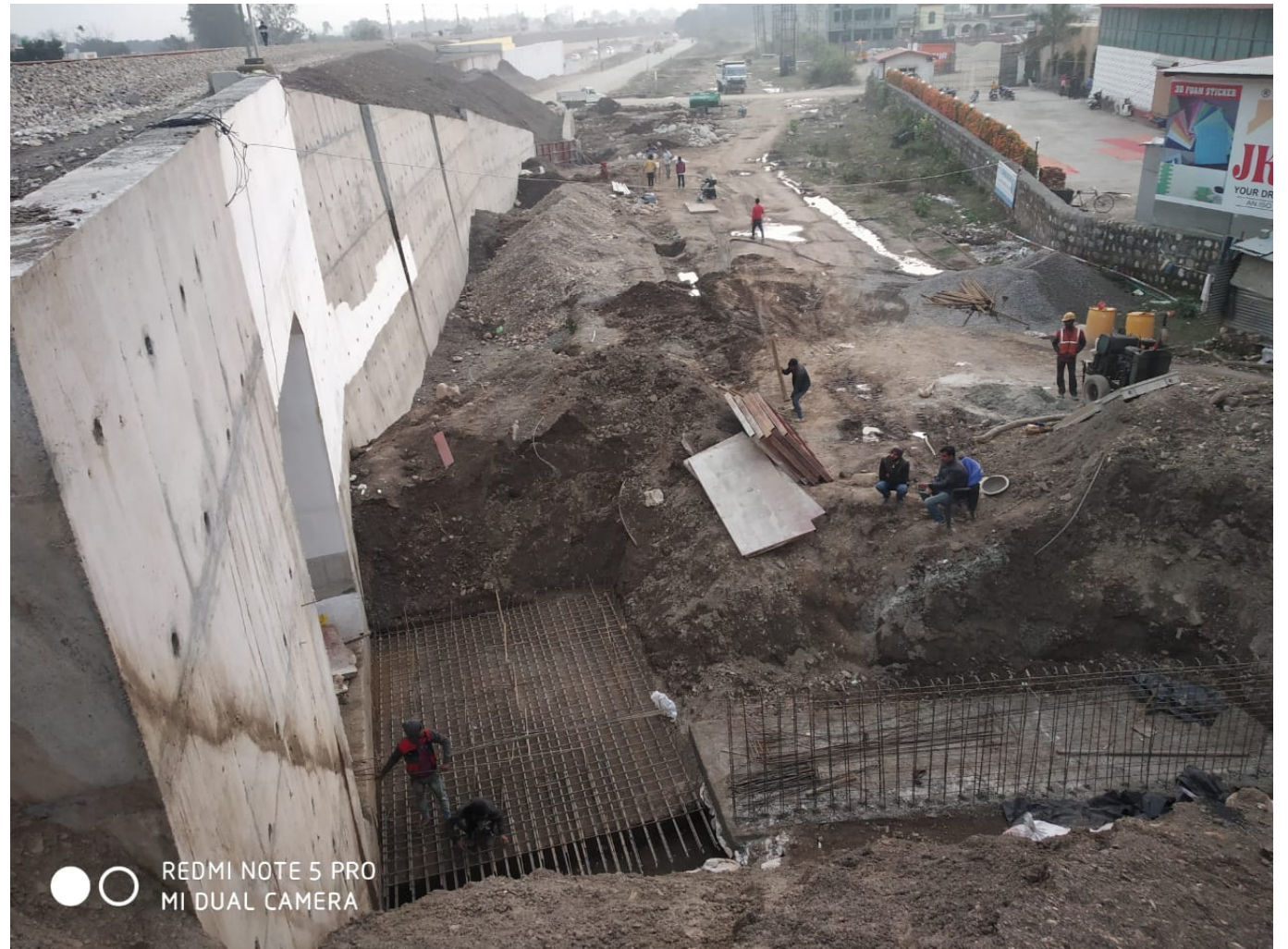
Toe Wall on Embankment near Road Under Bridge – Yog Nagari Rishikesh Railway Station – Rishikesh