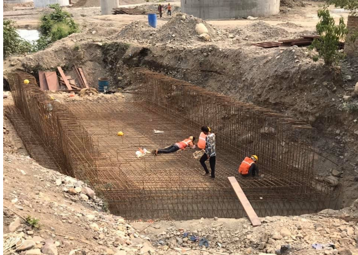
Skew Box Culvert on Approach Road – Left Bank of Chandrabhaga ji River – Rishikesh